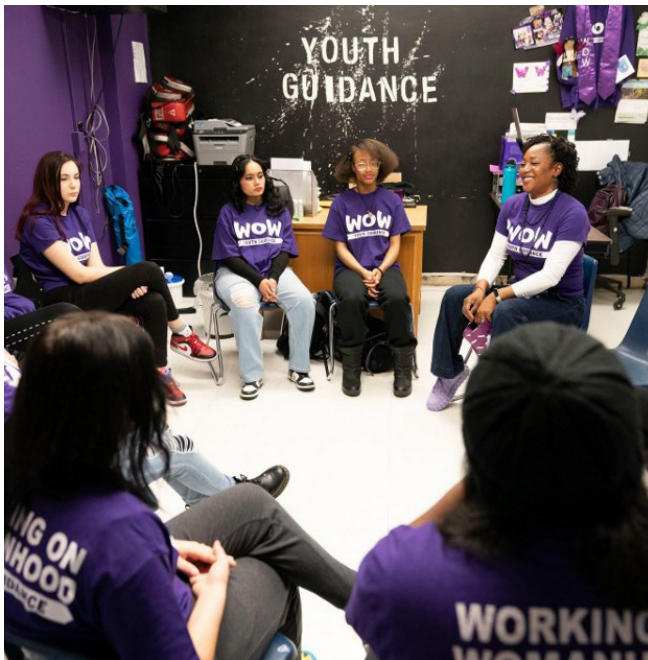
A group of young women come together as part of the Working on Womanhood Program

Trauma-related mental health research has traditionally focused on treatments for young men, especially in regard to gun violence prevention, even as the consequences of trauma are disproportionately borne by girls. Adolescent girls experience high rates of trauma exposure, which can lead to mental health challenges such as PTSD, anxiety and depression. However, there is a lack of rigorous evidence on how best to intervene to reduce these harms. In particular, there is a dearth of evidence about interventions designed specifically by and for Black and Latina women to reduce the detrimental effects of trauma-exposure.